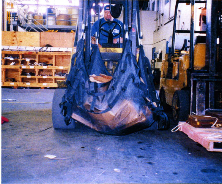
Mesh Tarp Area Sling Test Net 'A' (Working Load 500lbs.)