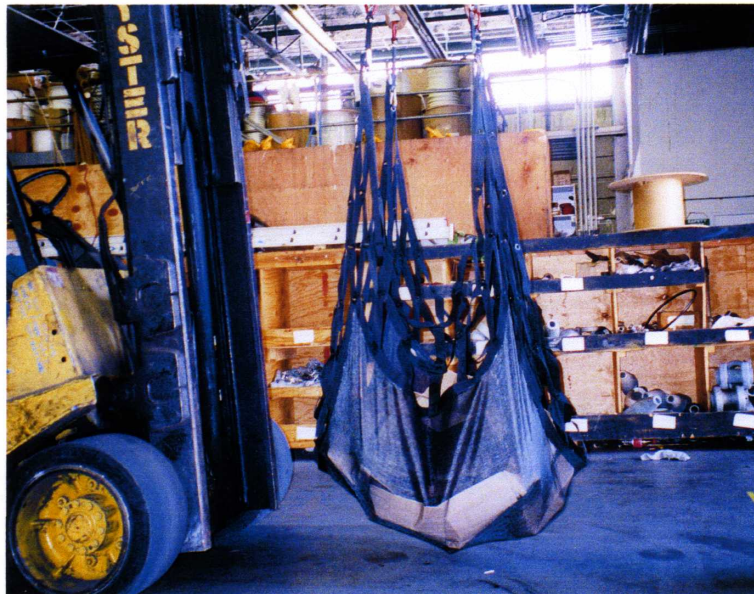
Cargo Net Area Sling Test Net 'B' (Working Load 300lbs.)

Note: Please see stamped certification sheet for breaking strength